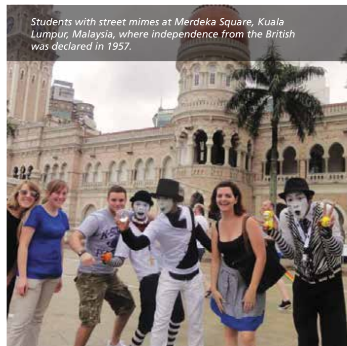
Students with street mimes at Merdeka Square, Kuala Lumpur, Malaysia, where independence from the British was declared in 1957.