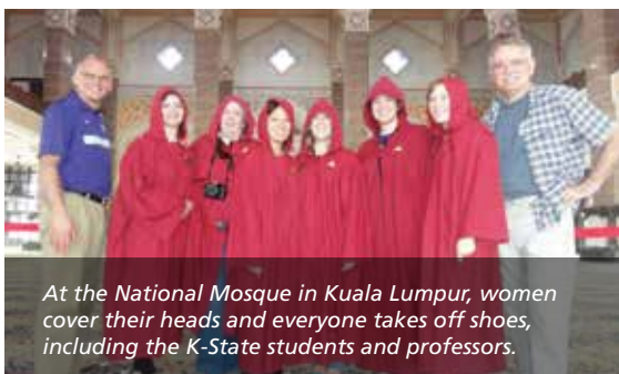
At the National Mosque in Kuala Lumpur, women cover their heads and everyone takes off shoes, including the K-State students and professors.