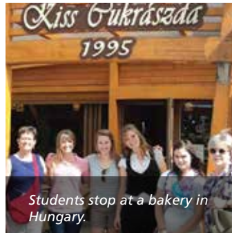
Students stop at a bakery in Hungary.

Looking back, the junior in communication sciences and disorders said the experience (she calls it "my miracle in Hungary") the most memorable part of a trip filled with the memorable.