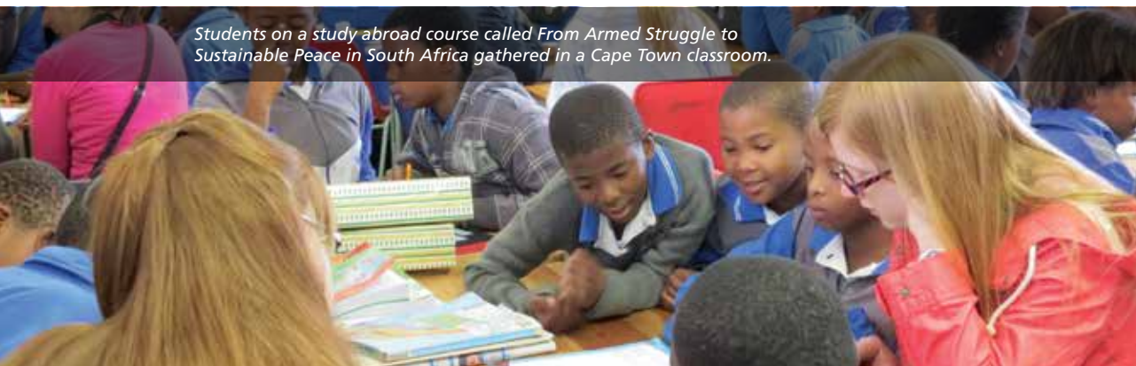
Students on a study abroad course called From Armed Struggle to Sustainable Peace in South Africa gathered in a Cape Town classroom.