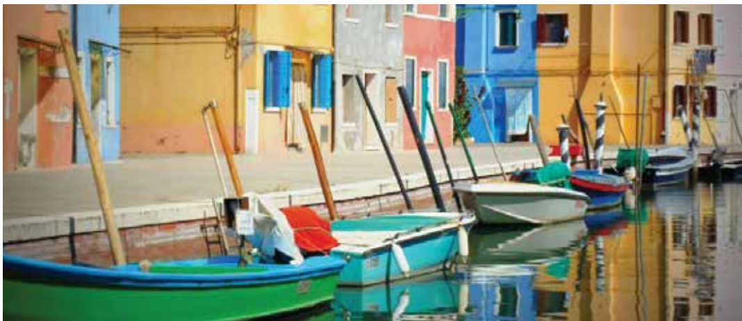
Students on Peggy Honey's design tours to Europe use photography to document history, record applications of design and absorb details. In Burano, Italy, Crystal Peterson, interior design senior, took this photograph for the portfolio Honey requires from all her traveling students.