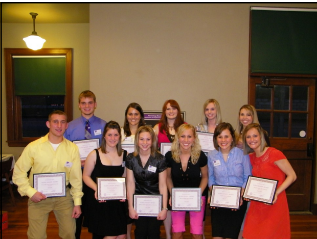
2009 Scholarship winners